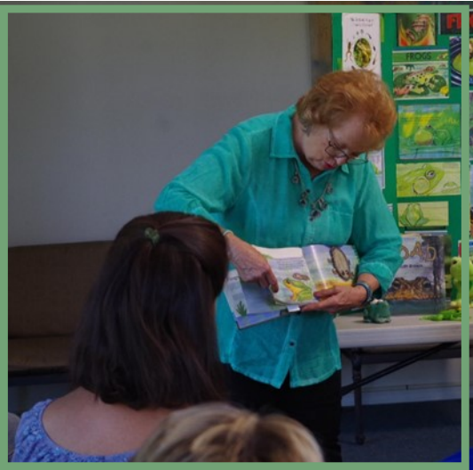
Education for garden club members