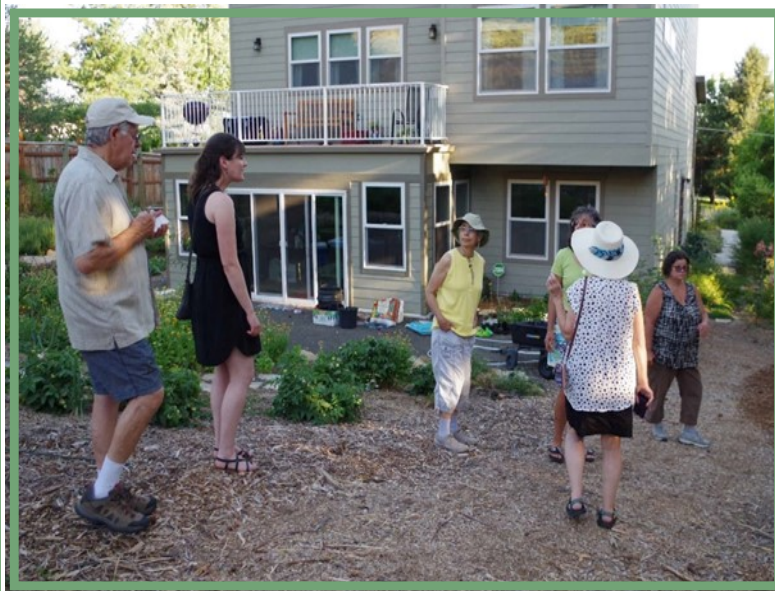
Garden Tours—learning how other people garden