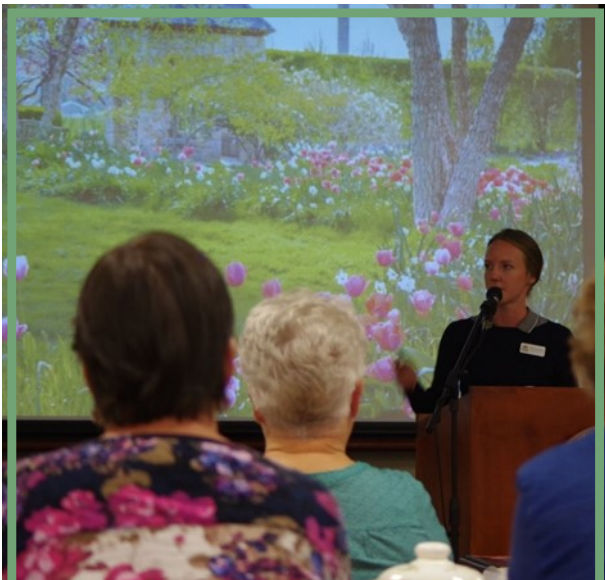
Guest speakers at district meetings educate club members