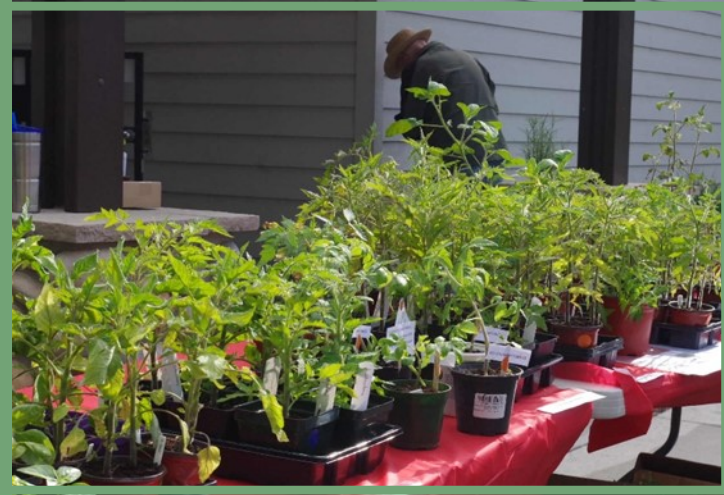
Plant Sales as fund raisers