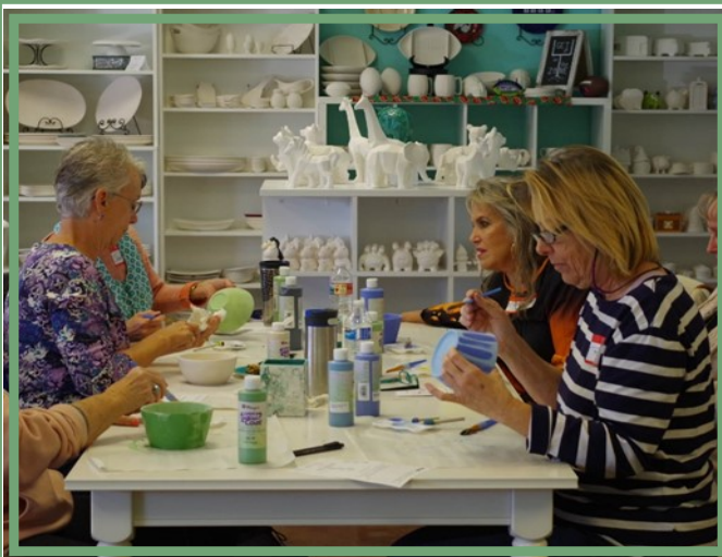
Painted bowls for Idaho Food Bank