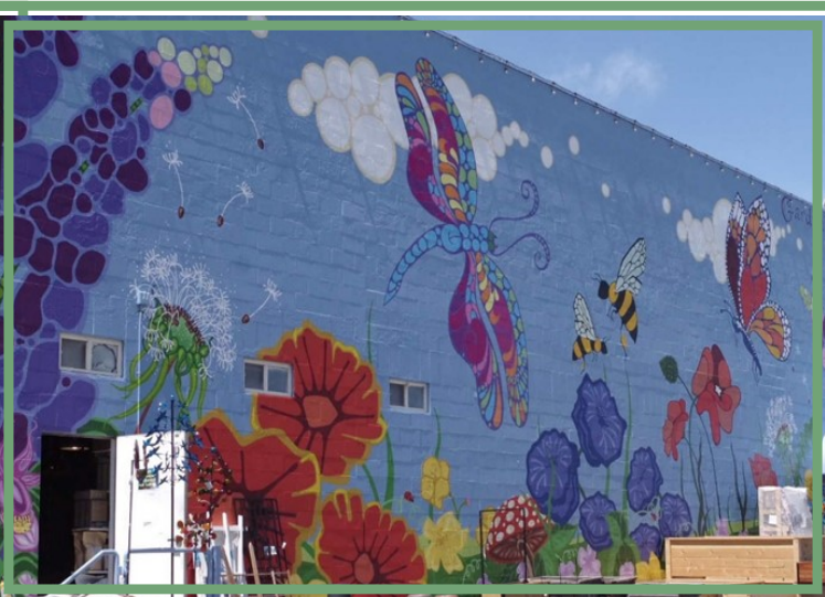
Experiencing and sharing the