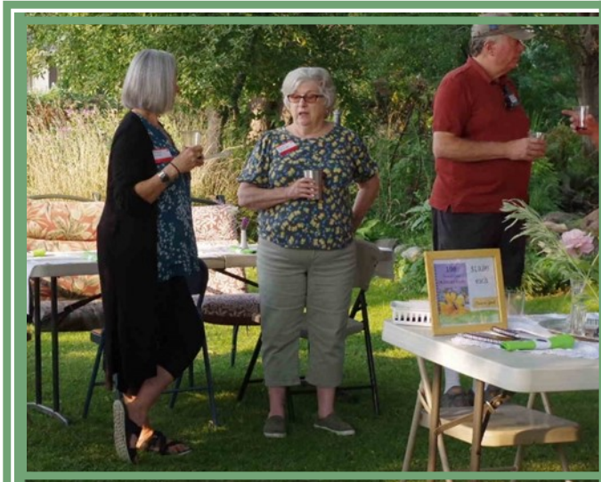
Lunch at district meeting