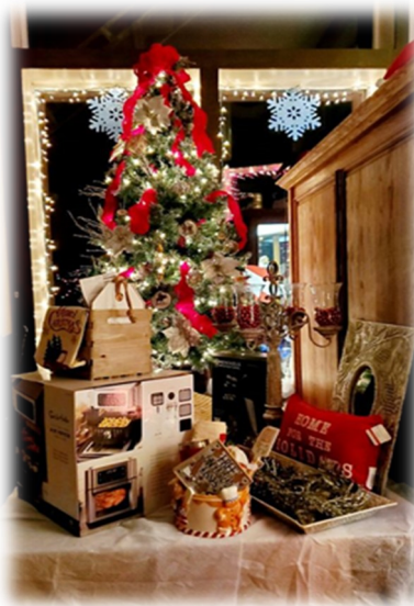
Sherill Calhoun's raffle tree and business-donated