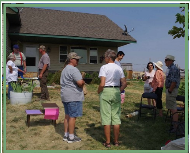
Education for the public