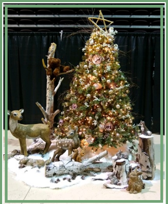
Festival of Trees—St Alphonsus Hospital