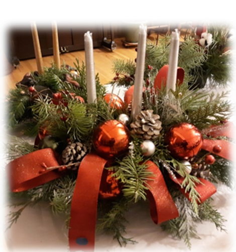
Arrangements for sale