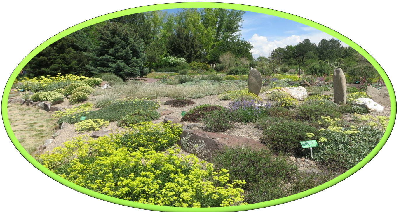
Orton Botanical Garden

Book resource: Xeriscape Plant Guide 100 Water-Wise Plants for Gardens and Landscapes